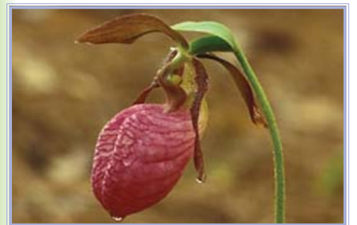
Pink Lady's Slipper