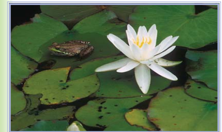
Sweet Scented Water Lily