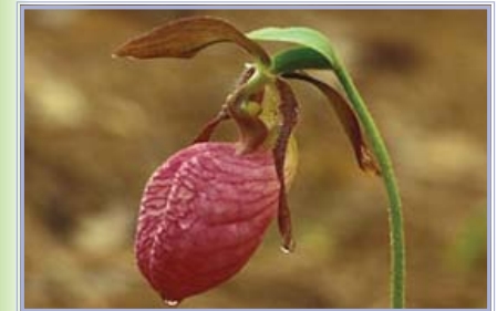
Pink Lady's Slipper